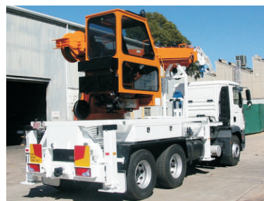
cabin rear mount